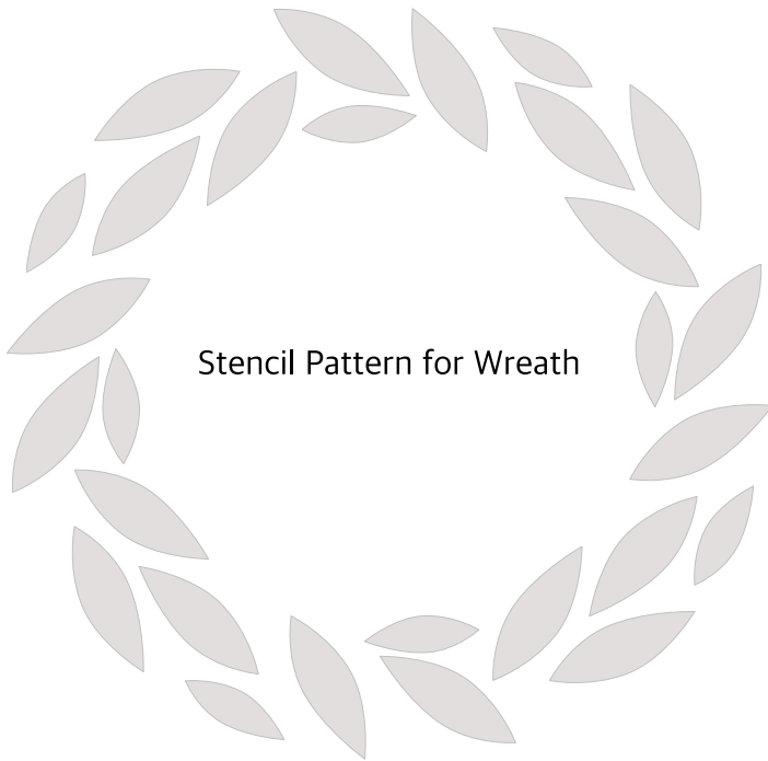
Stencil Pattern for Wreath