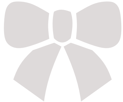
Stencil Pattern for Bow